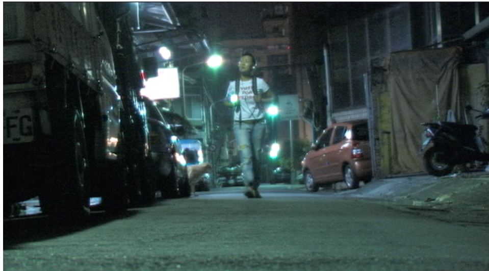
Taipei, Taiwan – 2005 First week of searching and getting to know Taipei City